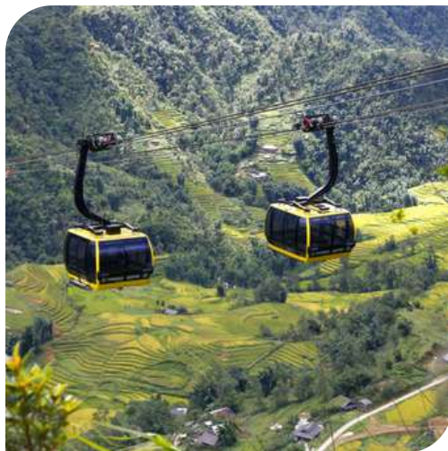
Fansipan Cable Car