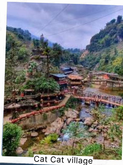
Cat Cat village

* Free herbal foot massage in 45 minutes ( 15 minutes : herbal foot bath with tea break , 30 minutes : massage , fruits serving)