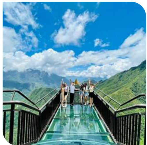
Glass Bridge Sapa